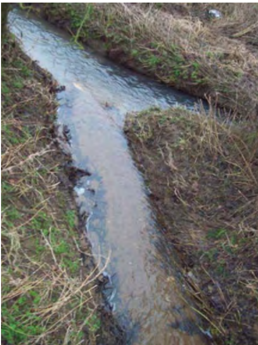
This picture shows an ordinary watercourse joining a main river.

It may not always be possible to see a clear physical difference between watercourses designated as either Main River or Ordinary Watercourse.