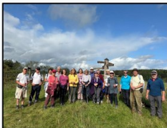
Nr. Levin Down, Chichester