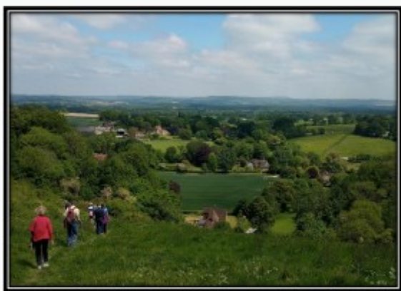
Treyford, Chichester