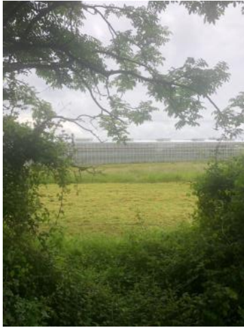
Field after cutting of wild flower meadow. Greenhouses behind.

A seemingly innocuous planning request to Arun District Council to allow year-round siting of 31 seasonal workers caravans at Newey Nursery close to Manor Farm Shop has opened this 'can of worms'.