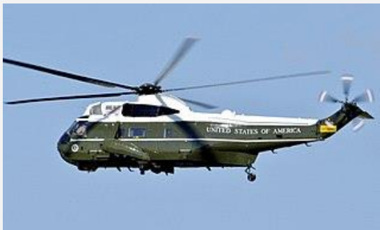
Marine One in flight.