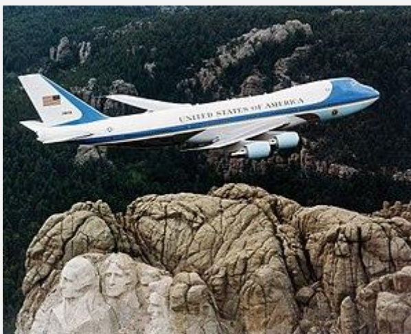
Air Force One over Mount Rushmore.