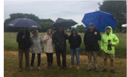
Locals turn out to witness the destruction of the flower meadow. 10/06/19

Moreover this application could be the 'tip of the iceberg' as residents have heard that the site applicant is already looking to obtain other nearby parcels of land which could be developed similarly.