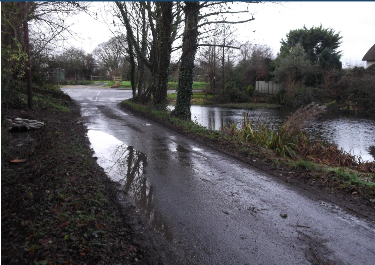
Florence Pond, Sidlesham