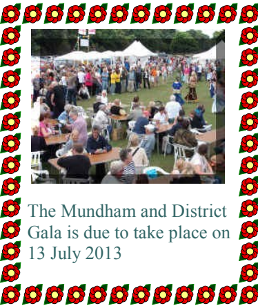
The Mundham and District Gala is due to take place on 13 July 2013